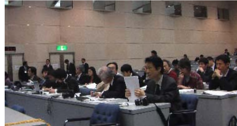
64 press gathered at UNU