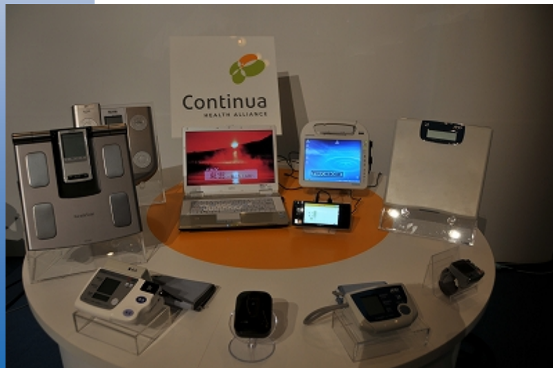
Device samples Continua Certified to be