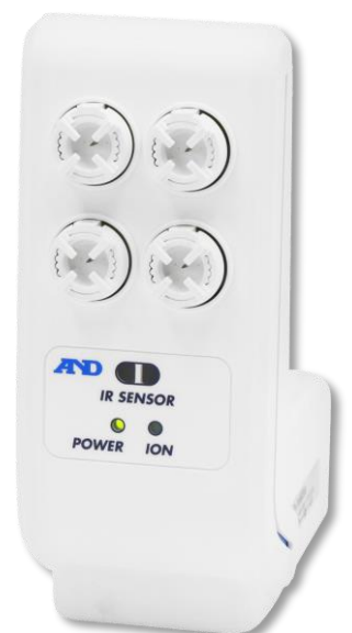
AD-1683A External Ionizer

And here's the quickest, easiest way to get rid of such problematic static — without wasting your time and effort!