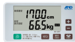
Height & Weight display mode