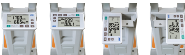
Flexible display orientation