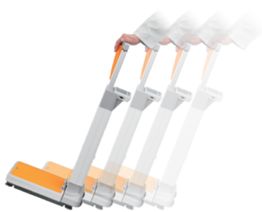
Easy to carry