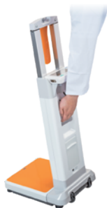
Lightweight & compact size