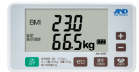
BMI & Weight display mode